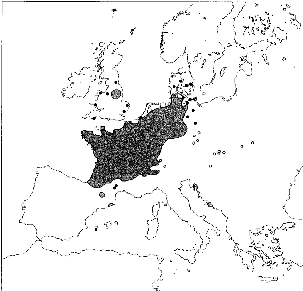
FIGURE 2. Distribution of Galeopsis segetum in Europe, redrawn from Meusel & Jager (1992). ● native. ○ introduced.

The unique distribution pattern which fits within the European context provides support for its native status.