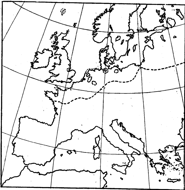
Map showing northern limit of Equisetum ramosissimum in Europe.