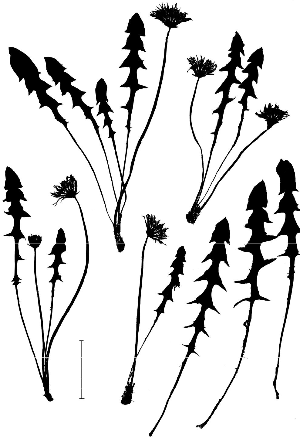
FIGURE 1. Taraxacum ronaе . Scale bar 5 cm.